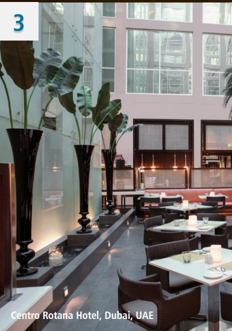
Centro Rotana Hotel, Dubai, UAE