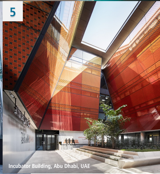
Incubator Building, Abu Dhabi, UAE