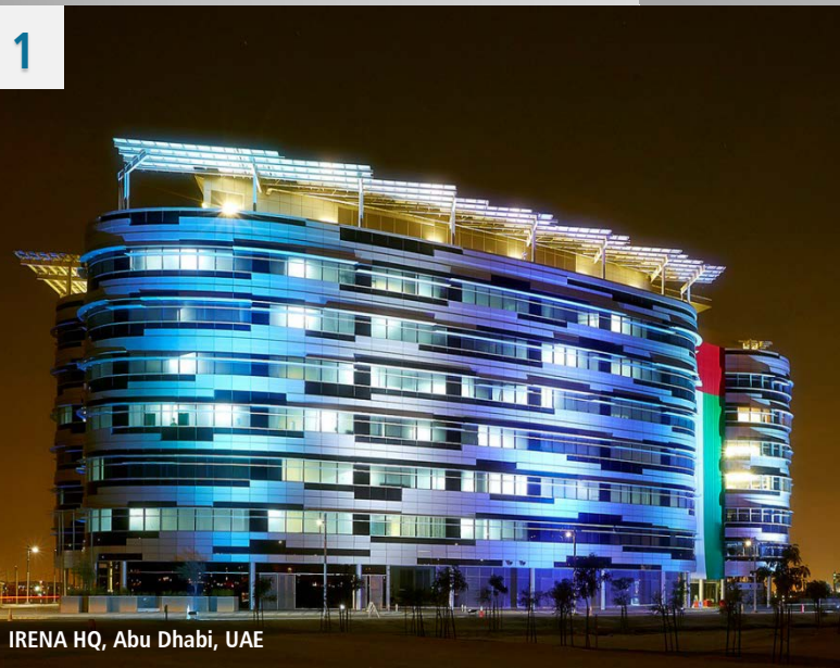
IRENA HQ, Abu Dhabi, UAE