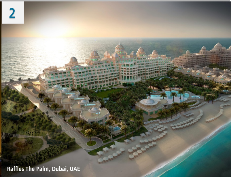
Raffles The Palm, Dubai, UAE