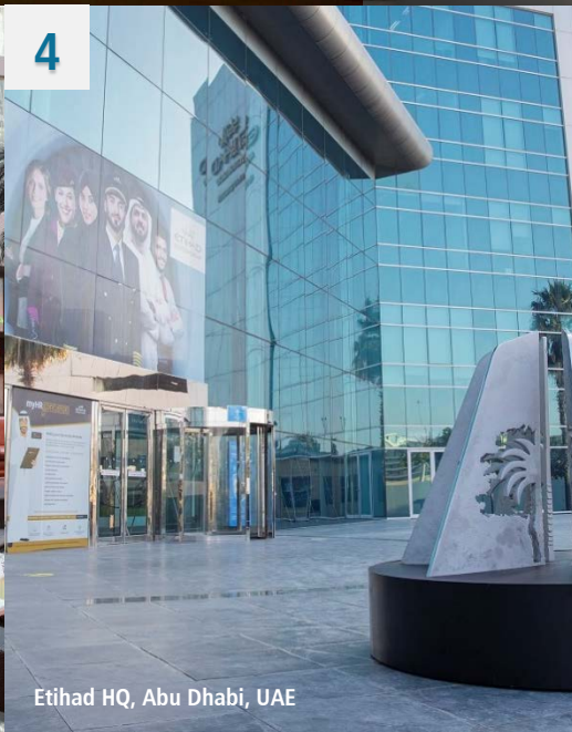
Etihad HQ, Abu Dhabi, UAE